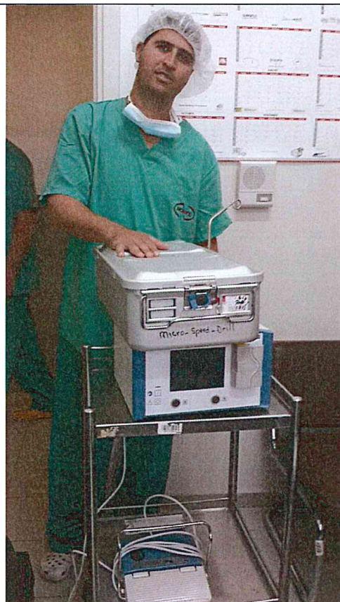
Electric High Speed Drill