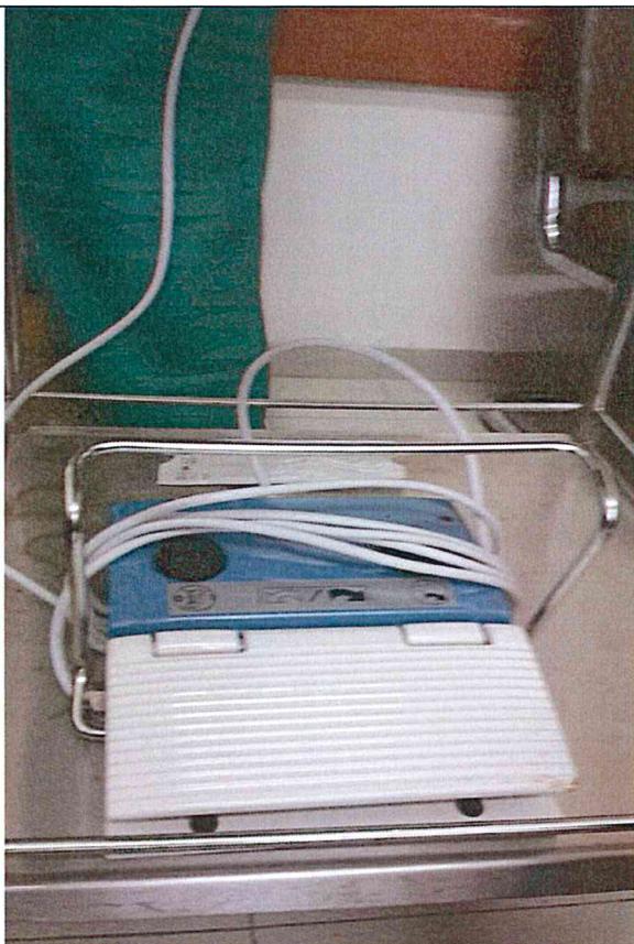
Electric High Speed Drill